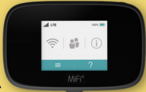
Library of Things